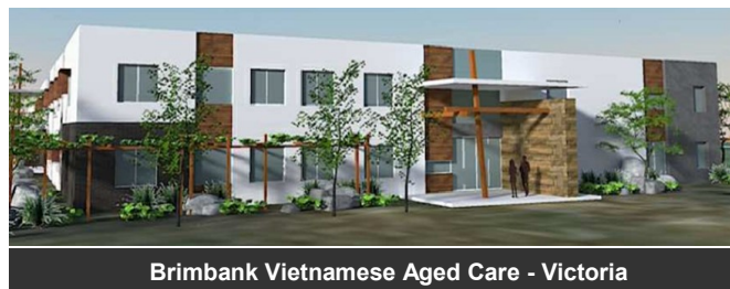
Brimbank Vietnamese Aged Care - Victoria