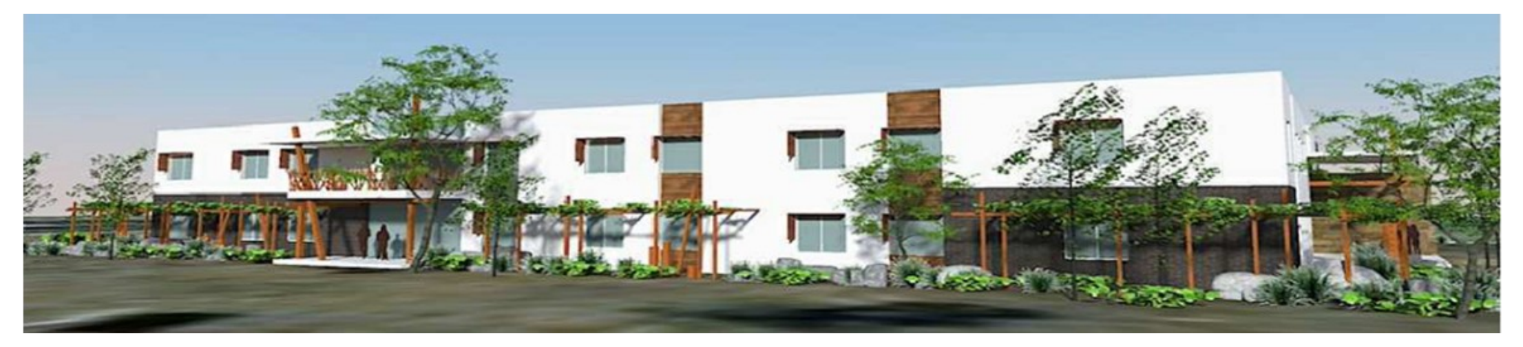
The pride of Vietnamese community in Australia

"Brimbank Vietnamese Aged Care is the symbol of long time and precious contribution of all the members, donors, volunteers, executives as well as the efficient continuous supports from the state and federal governments.